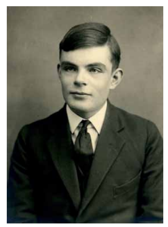
Alan Turing, aged 16, 1928

Why is that? Turing's life and science inhabited that mysterious region between the computable and the incomputable. Both in his research and in his life he persistently tried to make sense of things in what we can only describe as a computational sense. His well-known eccentricities such as chaining his mug to the radiator at Bletchley