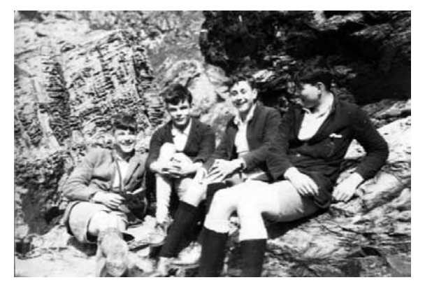
Photo taken in 1930 April, Bedruthan Steps, Cornwall

Of course, aspects of the 1936 Turing model were anticipated by others, such as Emil Post. The key extra ingredient was universality , based on the coding of machines as data. This essential feature of today's computer is often not understood though was certainly recognised by John von Neumann, and implemented in his 1945 EDVAC report, which was so influential in the later de-