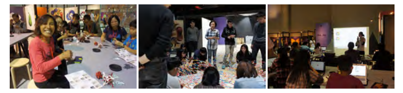
Fig. 8. Workshops accompanying the IMAGINARY exhibition at different venues in Taiwan. Left: polyhedra. middle: ZomeTool. Right: SURFER.

Taiwan, visiting local high schools in less urban areas, with the aim to promote the development of mathematics in various aspects, to raise the public awareness of the subject, and to connect the beauty of mathematics with daily lives and arts.