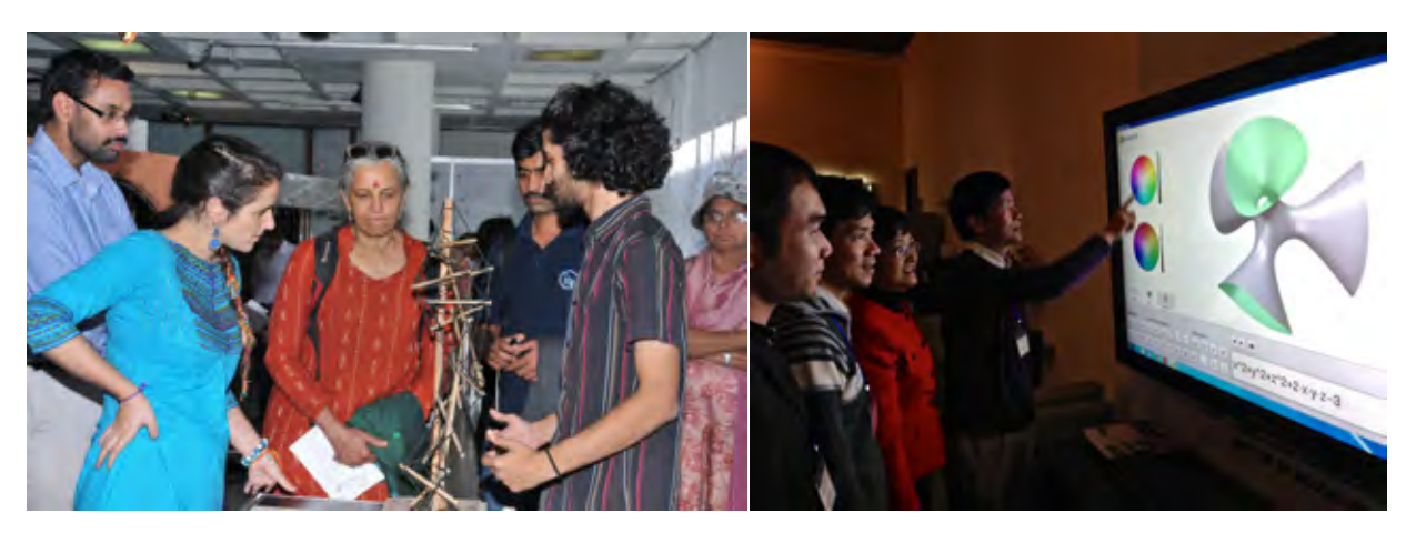
Fig. 5. Left: Mathematics of Planet Earth exhibition at Bangalore, India. Right: IMAGINARY exhibition at the Vietnam Institute for Advanced Study in Mathematics in Hanoi.