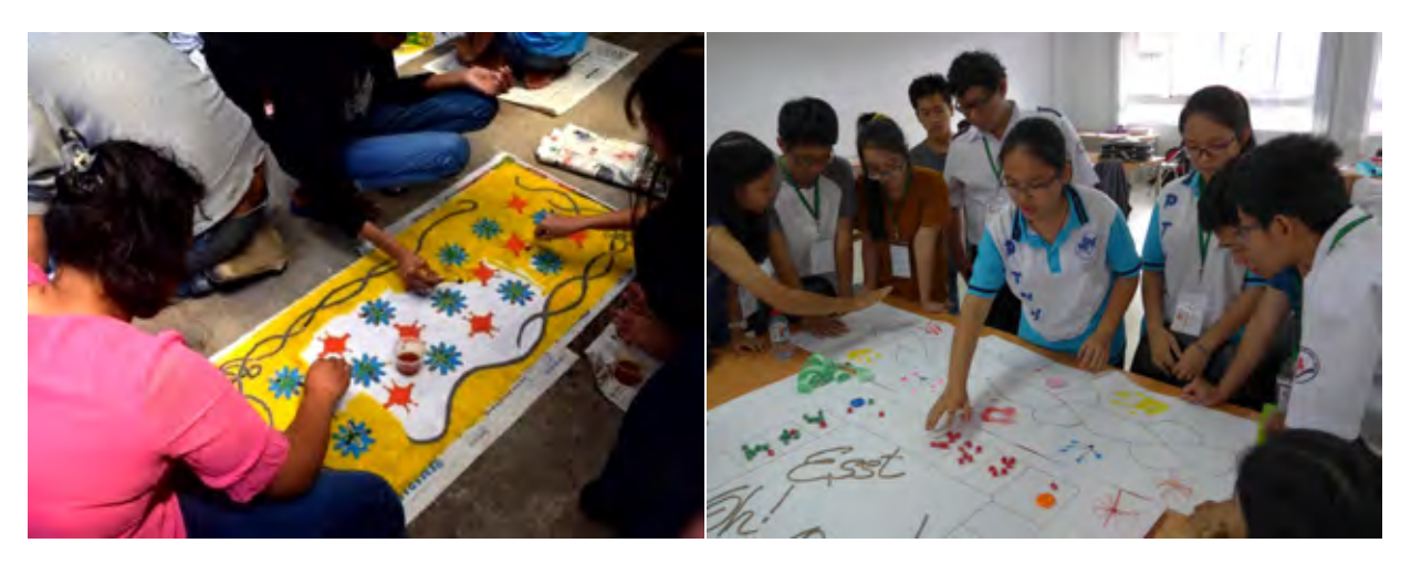
Fig. 9. Left: Tie dye Workshop in Indonesia. Right: Science Spaces Workshop in Vietnam.