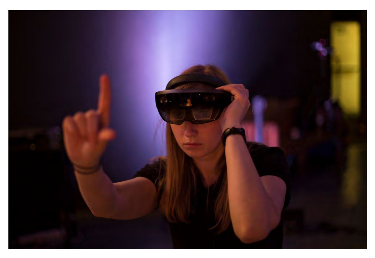
Fig. 11. Holo-Math presentation in France, Photo by Camille Cier.

(3) The projects runs based on a free, open access, and open source policy.