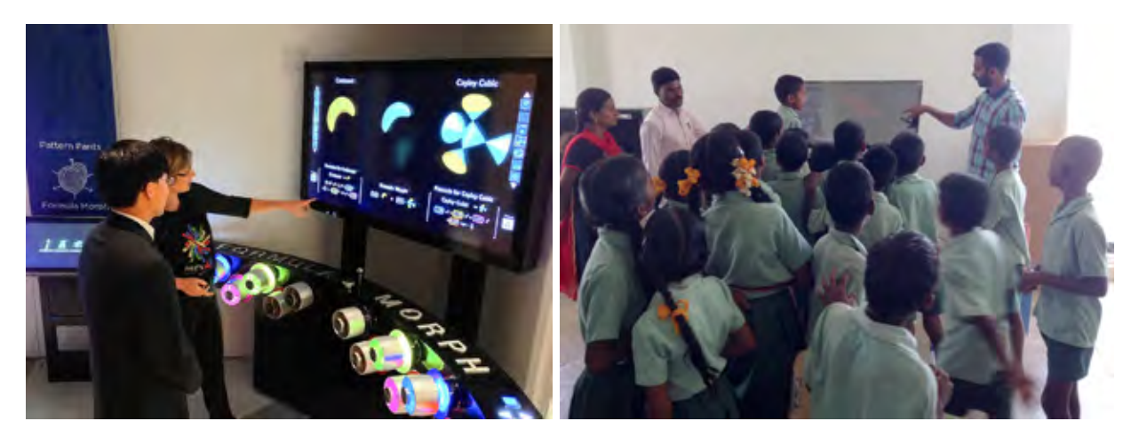
Fig. 2. Left: An algebraic geometry exhibit created in collaboration with IMAGINARY at the Museum of Mathematics in New York City, USA. Right: An interactive touchscreen station with a collection of 16 small mathematical apps and games at Ramanujan Math Park in the Agastya Campus, India.