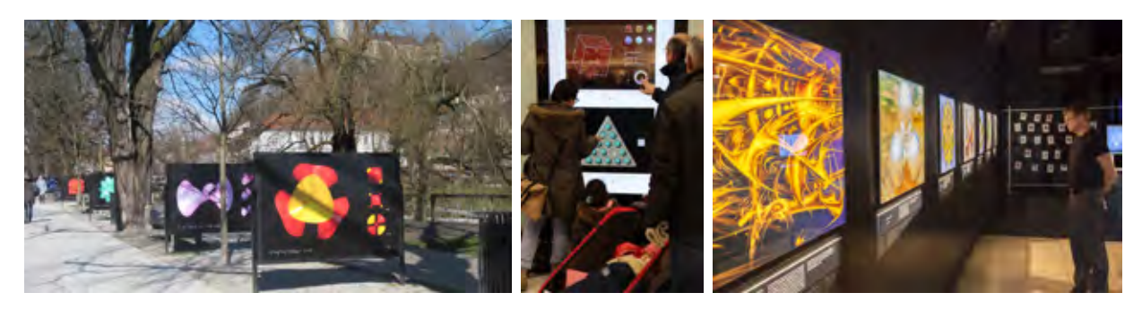
Fig. 12. Different venue options (right image: courtesy of Heidelberg Laureate Forum Foundation).

at a central square of a town. You should choose your venues that suit your desired target audience and can be anything from colleges, universities, art galleries, schools, public squares, train stations, shopping malls, or bank foyers, see different venue examples in Fig. 12. Ideally a cosponsorship can be agreed upon by the venue in order for it to be available free of charge. As for the budget; $2000 should be sufficient to get you started with an exhibition, but going all the way up to $200,000 will obviously generate quite different results in terms of appeal and ease to draw in audiences. In the end expenses will depend on the use of paid staff, or volunteers, number of exhibits and type of exhibits. Trying to find a sponsor is worthwhile or using a host institution such as a university may partly cover required costs. Sponsors can be found in the private and public sectors, such as government sponsorship, e.g. the Ministry of Research and Education in Germany, or banks and high tech companies and philanthropic organisations.