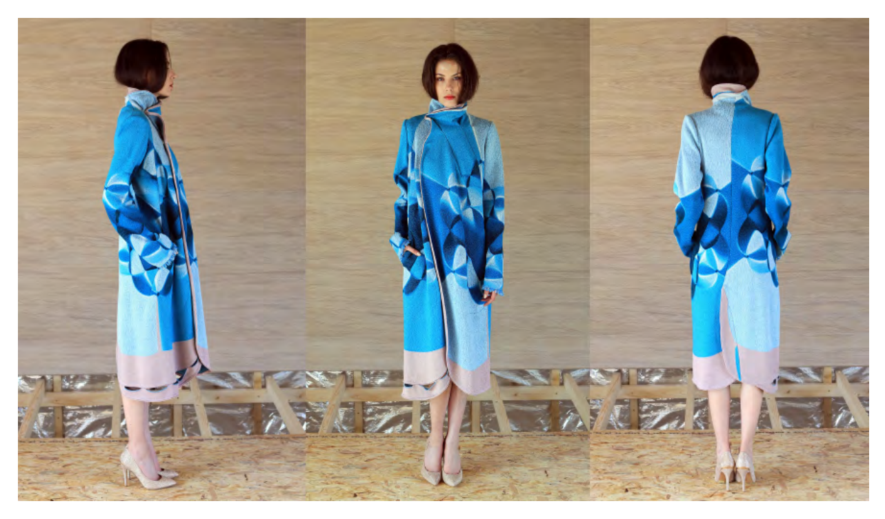
Fig. 18. Lady's coat, part of the Draž collection.

applied them to knitted textures. The result is a colourful collection with strong graphical elements and uneven silhouettes which follow individual knitted textures, see Fig. 18.