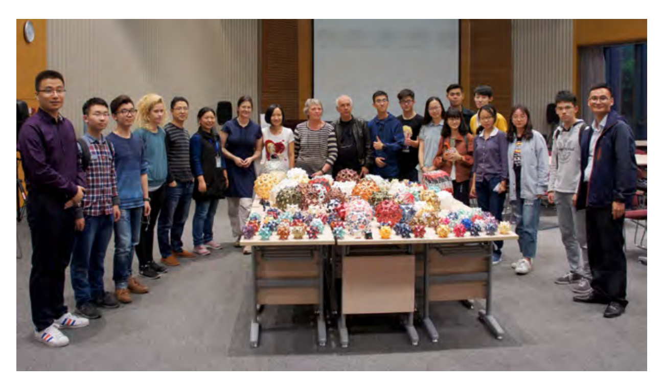
Fig. 4. IMAGINARY workshop in Suzhou, China.

In November 2013, a Mathematics of Planet Earth exhibition was shown at the Visvesvaraya Industrial and Technological Museum in Bangalore, India, see the left panel of Fig. 5. It was organised by the International Centre for Theoretical Sciences (ICTS) and Center for Applicable Mathematics (CAM) of Tata Institute of Fundamental Research (TIFR). The exhibition was based on the four major themes: Waves, Networks, Optimisation, and Structures. It featured more than 30 different exhibits, and it offered various outreach activities for school students and teachers such as open quiz sessions or hands-on astronomy based activities.