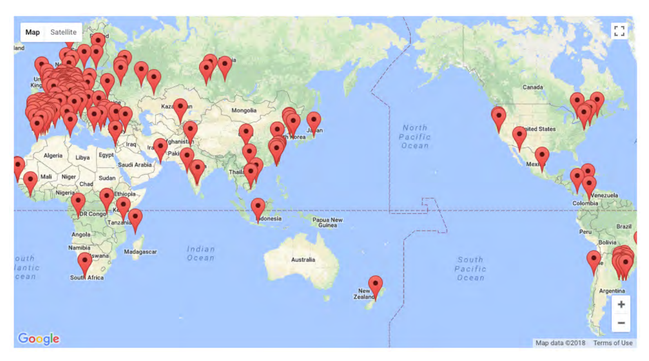
Fig. 1. Map indicating all locations with past IMAGINARY related events in the world.