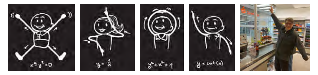
Fig. 17. Conveyor belt design at the Mathematikon shopping center in Heidelberg, Germany.

The name MathLapse is inspired by the timelapsetechnique in physics: By re-scaling time, phenomena are visualised which we cannot observe directly. Watch out for future competitions, where your exhibit idea may even result in a cash prize.