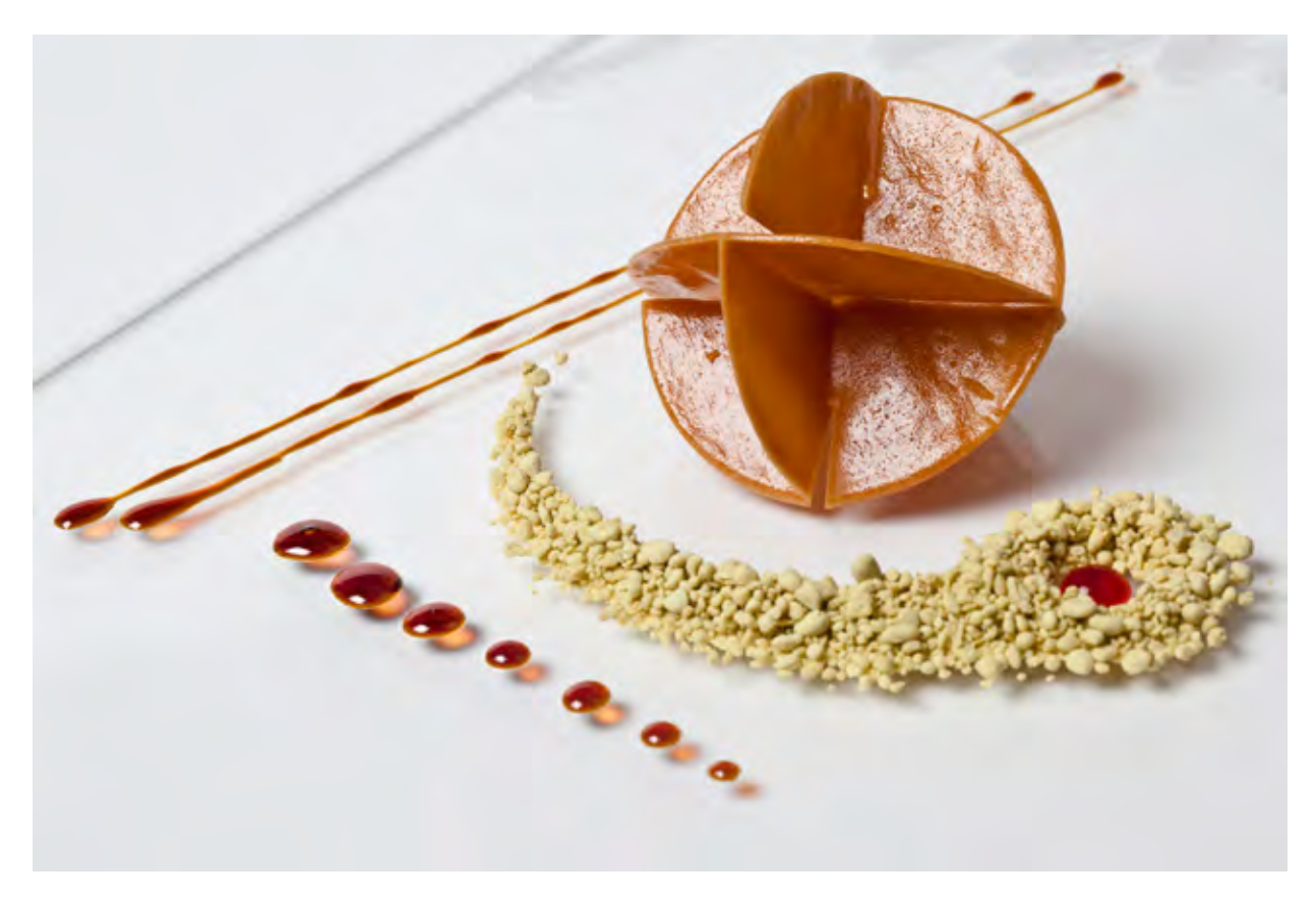
Fig. 16. Impression of the exhibition "The Taste of Mathematics", courtesy of Pedro Reyes Dueñas.