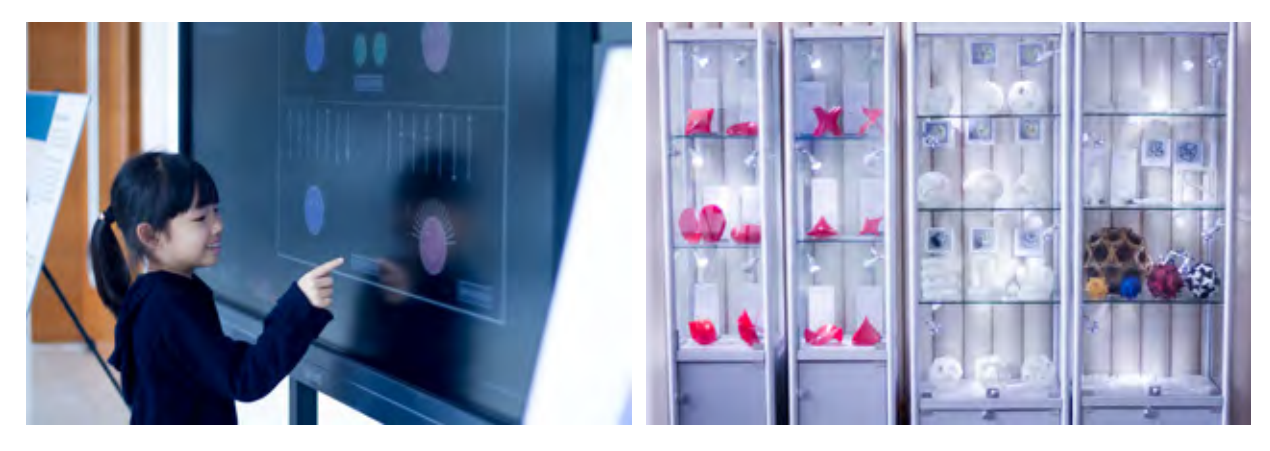
Fig. 3. IMAGINARY exhibition at XJTLU in Suzhou, China.