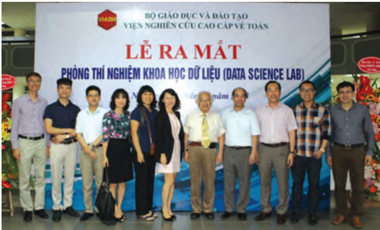
The Opening Ceremony for Data Science Lab (DSLAb)