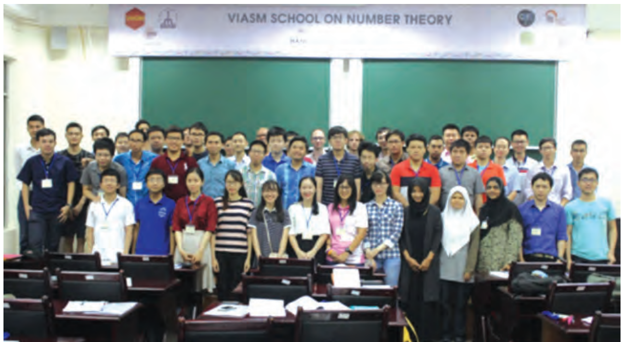
Participants of VIASM school on Number Theory (June 18–24, 2018)