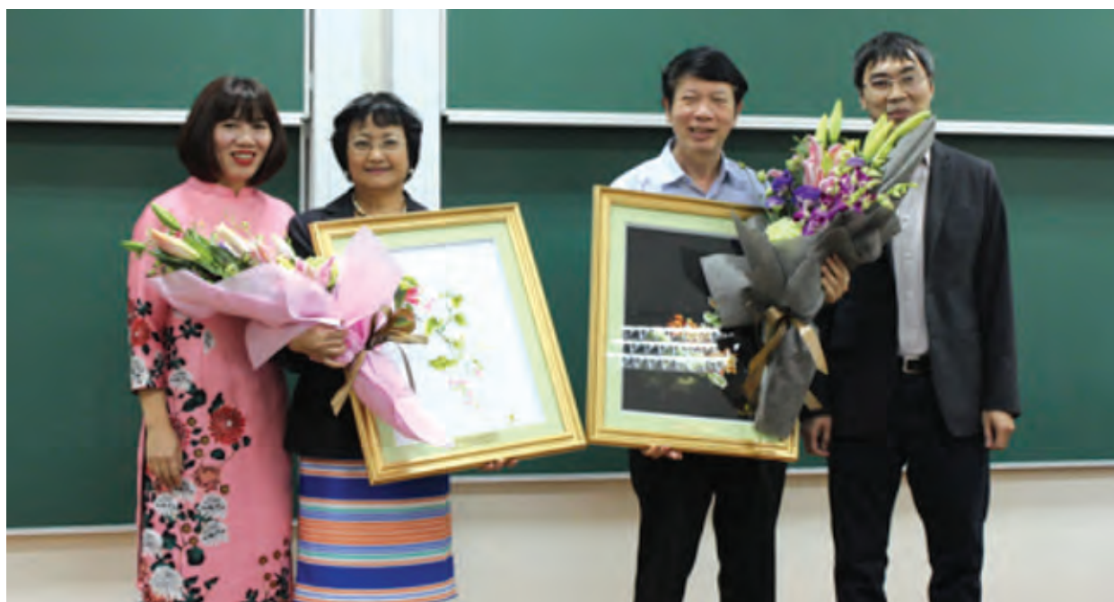
VIASM New and Former Board of Directors