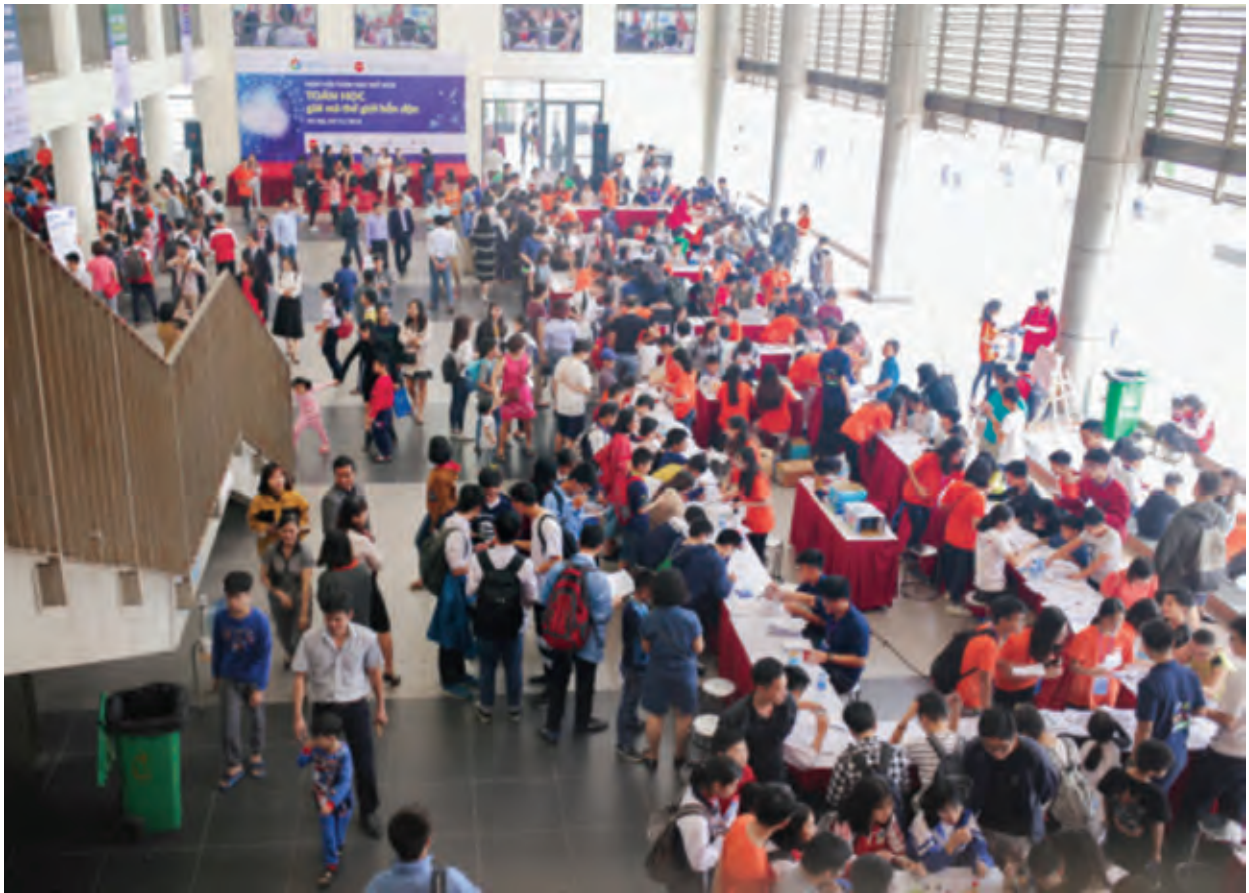
Participants for Math Open Day 2018