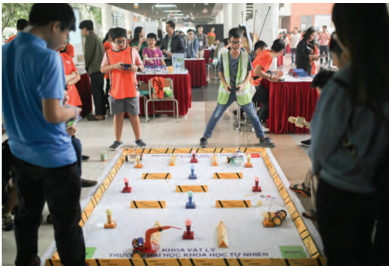
Students enjoy participating in the mathematical scientific experiments

In December 10, 2018, together with the VNU University of Science, Ho Chi Minh City and the University of Saigon, VIASM organised similar Math Open Day event for the first time in Ho Chi Minh city. It is hoped that this will become an annual event in Ho Chi Minh City.